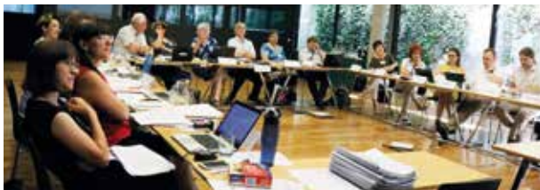
13 July 2017. 2nd Transnational Partner Meeting, hosted by EURAC Research, Bolzano/Bozen, Italy